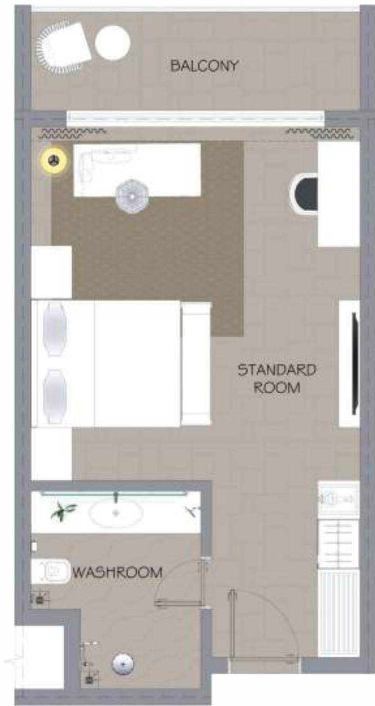
1 st , 2 nd , 3 rd & 4 th FLOOR PLAN

Typical Floor Plan Area: 625 sq. ft. (Approx) | Unit: 152